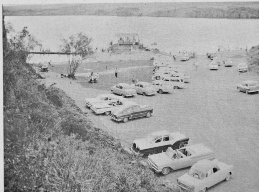
An active civic club with the help of townspeople, farmers and a benevolent landowner developed this attractive lakeside recreational area.