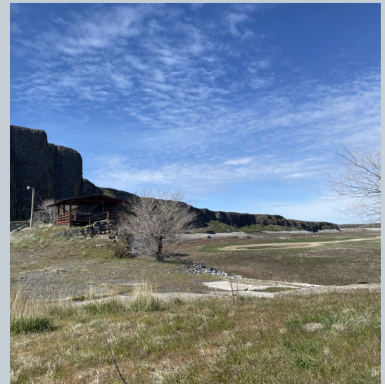
Gazebo from behind the boat launch, 2022