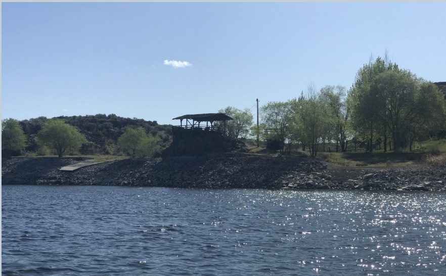
Gazebo from across the lake, 2018