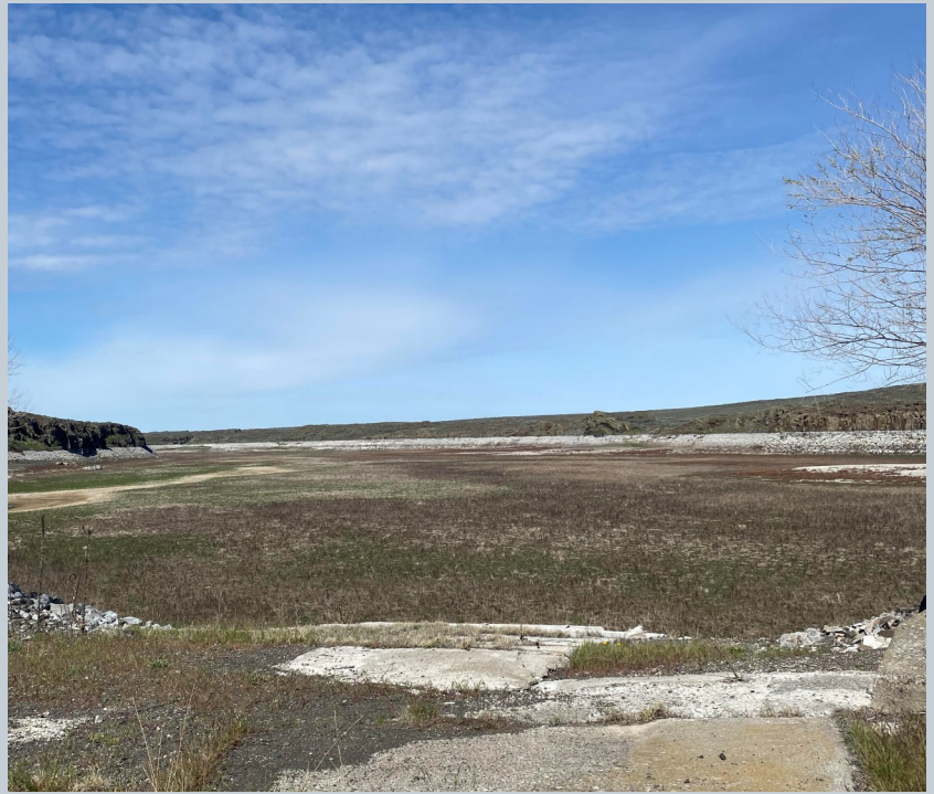
View from the boat launch in 2022