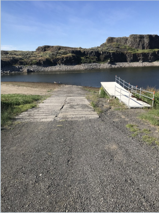
Boat launch perspective, taken in 2018